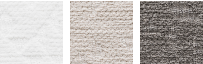
01 WHITE CAP