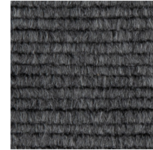
05 MANTA RAY