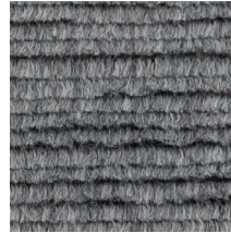
04 PERFECT GREY