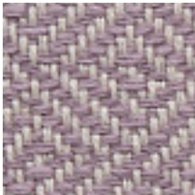
04 LILAC FOG