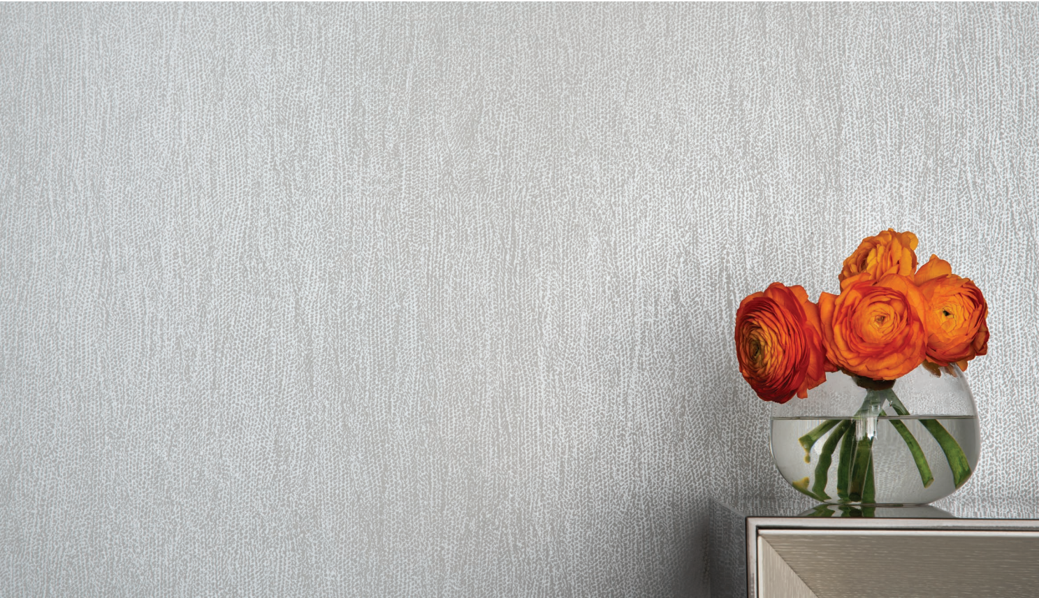
FEATURED W1056/07 STERLING AND BRIMSTONE CONSOLE