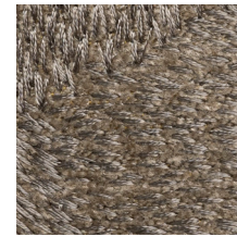
02 GOLDEN GREY