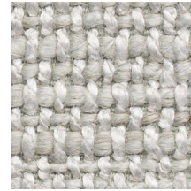
02 DEW DROPS