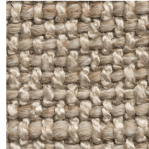
04 NATURAL STATE