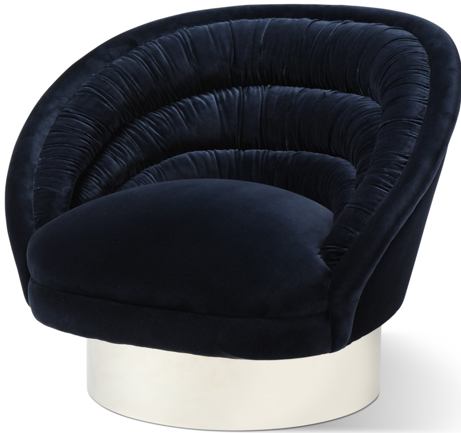
Ellipse Lounge Chair Model - 1976 | Designed 1976