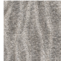
02 LUCKY STRIKE