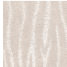
01 WHITE ELEPHANT