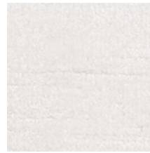
01 FIRST LIGHT