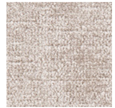
03 ROSE QUARTZ