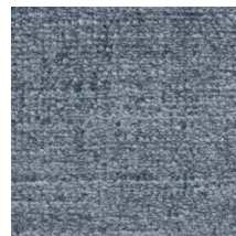
15 CLASSIC BLUE