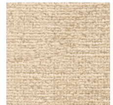
14 NEW CAMEL