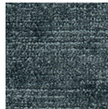
10 DEEP TURQ