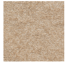
03 NATURAL STATE