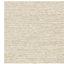
02 HALF BLEACHED