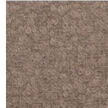
04 SILVER BROWN