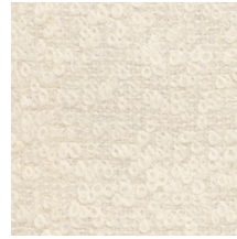
01 SOFT LIGHT