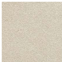
01 PEARL (PRINTED ON 8002/02)

Dashed lines indicate average largest cut yield *Pattern is not shown to scale