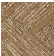
7148/01 AUTUMN HARVEST (PRINTED ON 7000/02)

Dashed lines indicate average largest cut yield *Pattern is not shown to scale