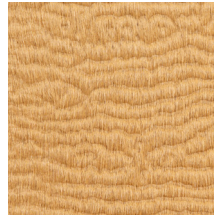
01 SUMMER SUN