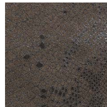
01 SILVER BROWN (PRINTED ON 8002/16)