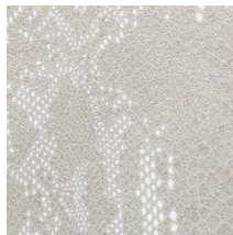
03 FROZEN (PRINTED ON 8002/02)

Dashed lines indicate average largest cut yield *Pattern is not shown to scale