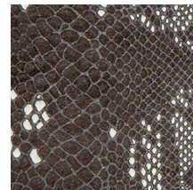
02 RAVINE (PRINTED ON 8002/07)