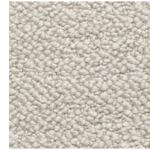
02 TRUE GREY