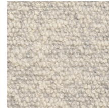
02 TRUE GREY