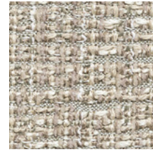
02 GOLDEN GREY