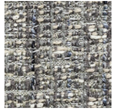
03 AFTERNOON SKY