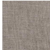
04 SILVER BROWN