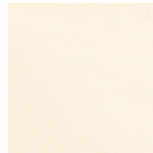
01 SOFT LIGHT