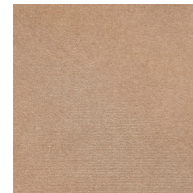
02 NATURAL STATE