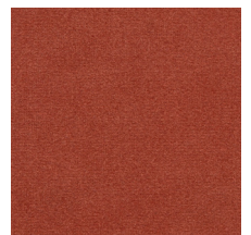
09 INDIAN SUMMER