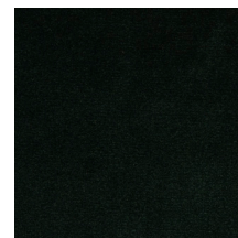
08 TRUE NAVY