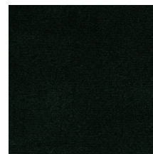
07 DEEP EMERALD