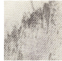
02 FRENCH LAVENDER