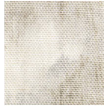
01 NATURAL STATE