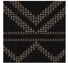
03 BLACK NIGHT