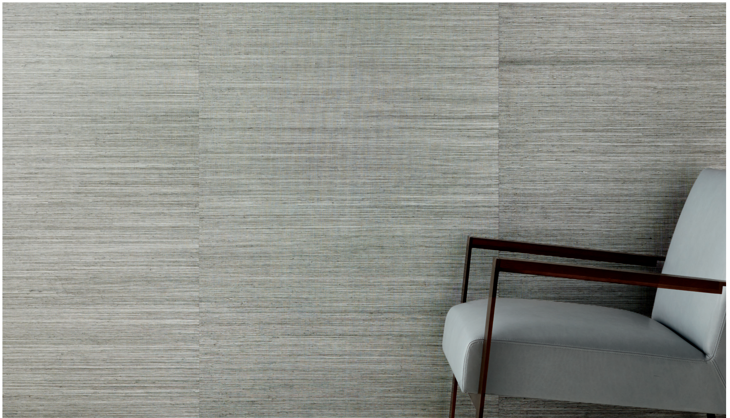
FEATURED W5014/090 STORM AND NEW LINDEN LOUNGE CHAIR