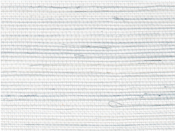
W5014/092 SILVER BLUE