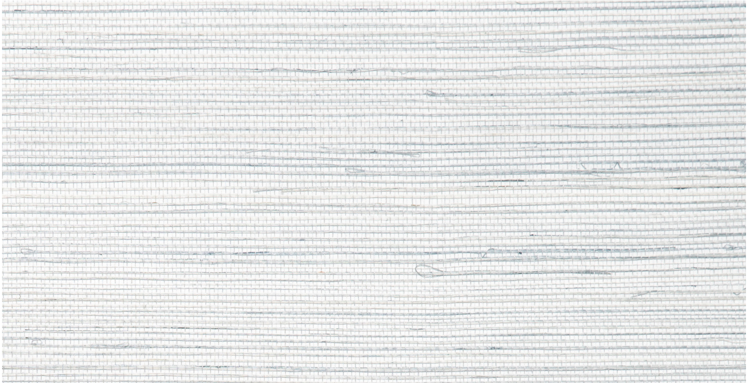
W5014/092 SILVER BLUE