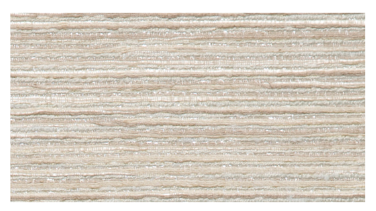
W3010/034 SILVER BLUE