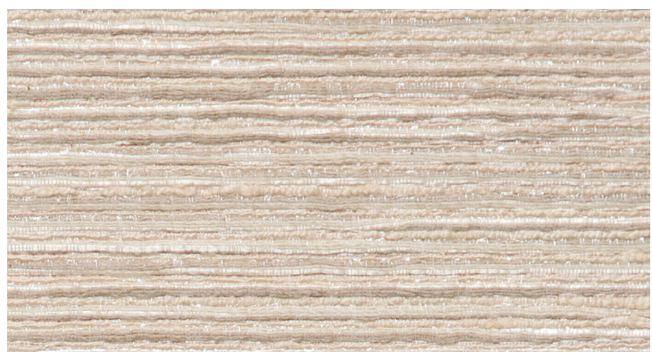
W3010/033 STONE HARBOR