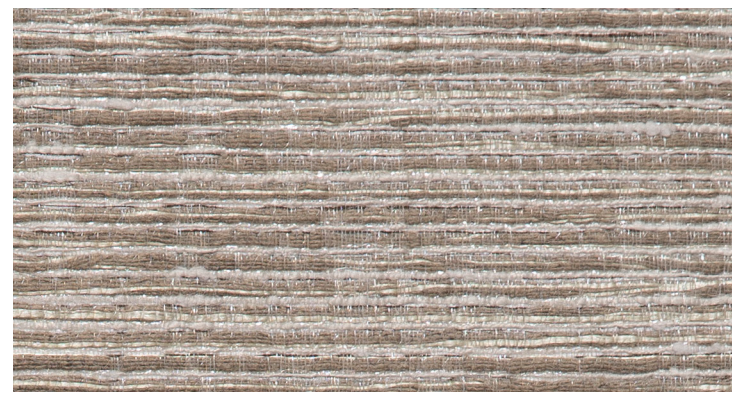
W3010/036 SILVER TAUPE