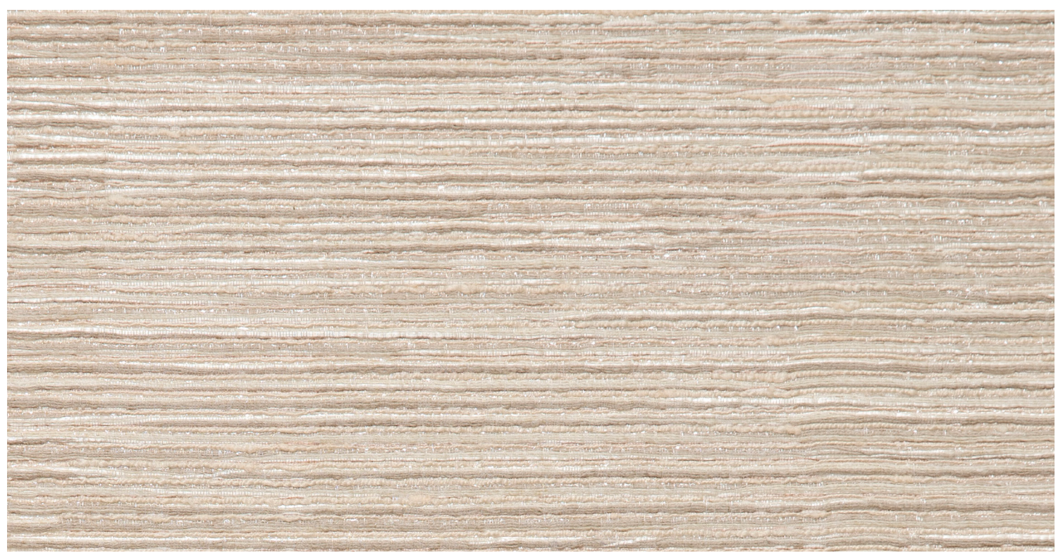
W3010/033 STONE HARBOR