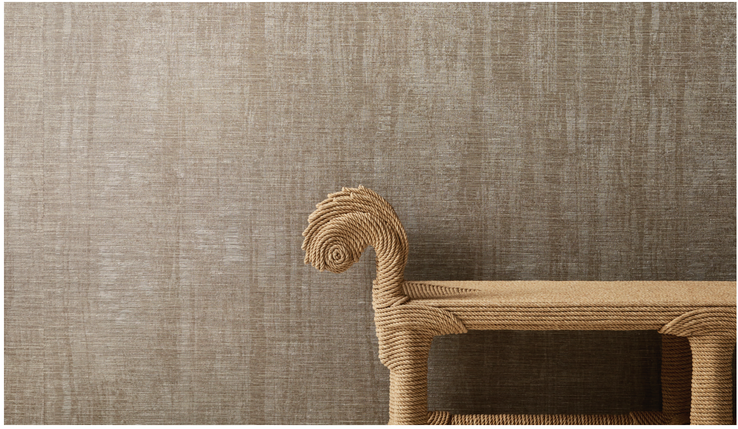
FEATURED W3010/036 SILVER TAUPE AND CHRISTIAN ASTUGUEVIEILLE MOISSU BENCH