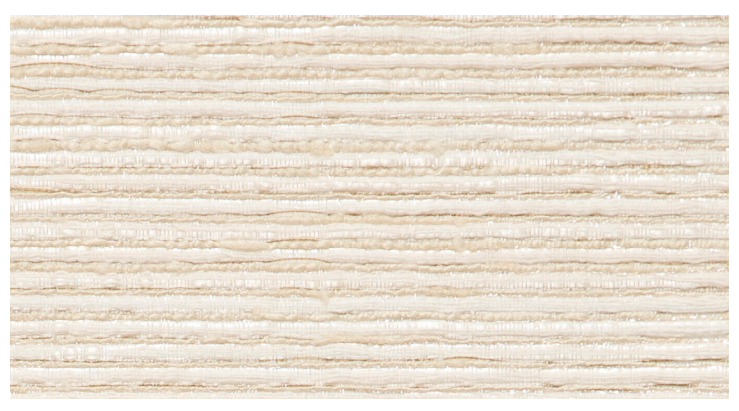
W3010/032 MORNING LIGHT