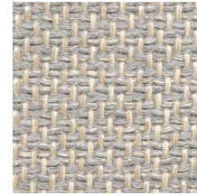
02 WARM & COOL