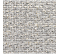
03 TRUE SILVER