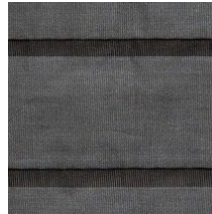
04 STORM CLOUD