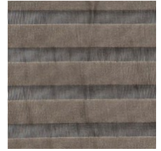
03 SMOKE SHOW