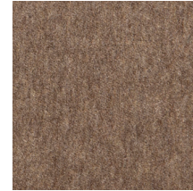
05 SILVER BROWN