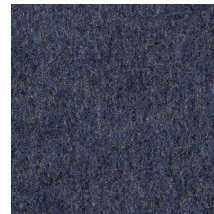
07 BLACK NAVY