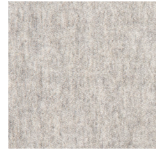
03 WARM SILVER