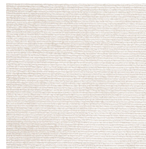
01 WHITE SAND