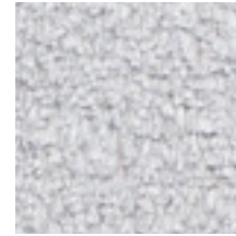
02 COLD WATER