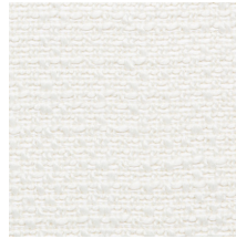
01 SOFT LIGHT