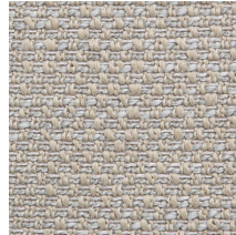
04 GOLDEN GREY