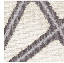
02 SILVER STREAK