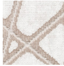
01 FINEST WEB