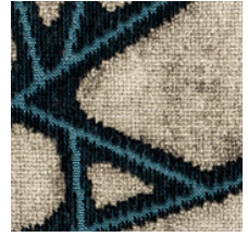
05 STRANDS OF TURQ