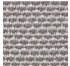
03 PERFECT GREY