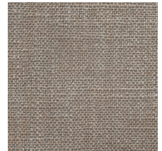
06 PEAT HEATHER