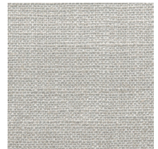
03 TRUE SILVER