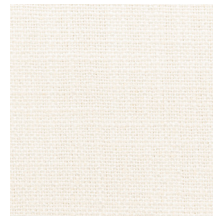
01 WINTER WHITE

Knit backing is recommended for use on HOLLY HUNT upholstered product. For all other upholstery, please consult your workroom.