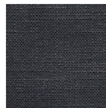
07 BLACK NAVY