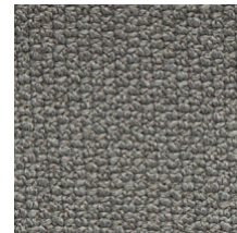
02 SEA MIST