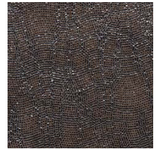
03 COCOA (PRINTED ON 8002/06)