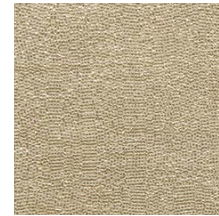
02 GOLDEN (PRINTED ON 8002/01)