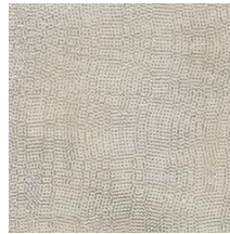
01 SILVER PLATED (PRINTED ON 8002/01)

Dashed lines indicate average largest cut yield *Pattern is not shown to scale