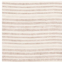
01 BLEACHED & WARM

• Knit backing is recommended for use on HOLLY HUNT upholstered product. For all other upholstery, please consult your workroom.