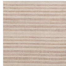
02 NATURAL & WARM