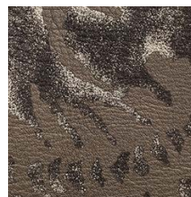
7153/01 BY CANDLELIGHT (PRINTED ON 7002/01)