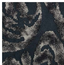
7152/01 NIGHTFALL (PRINTED ON 7000/19)