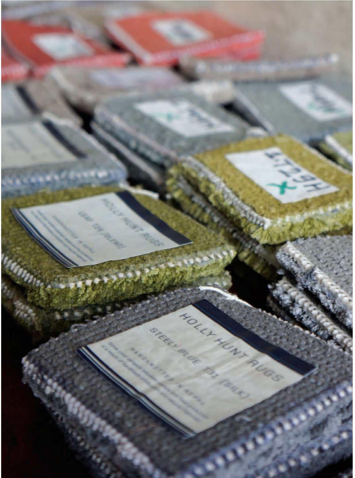
From Nepal to showroom