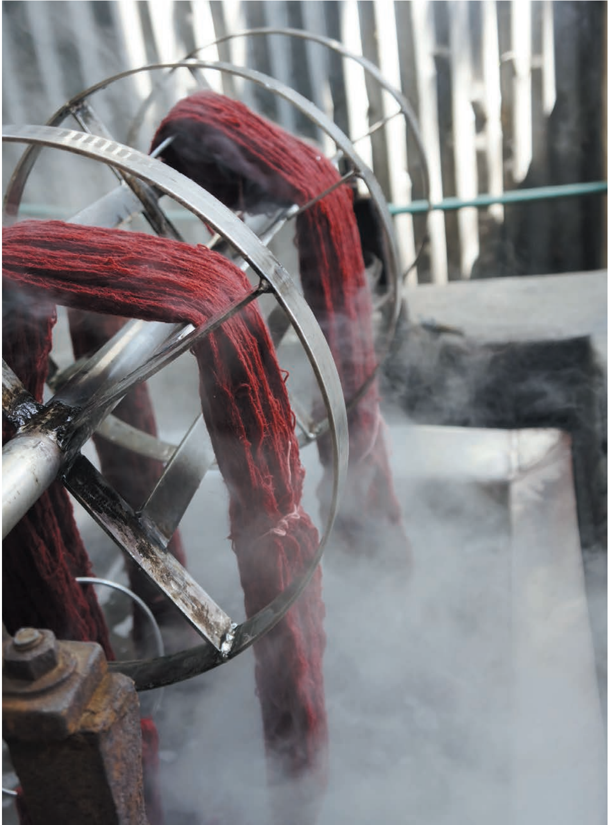
Small pot dyeing yields rich hues