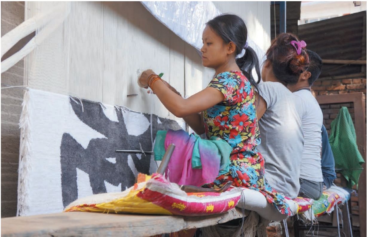
Each step of the process is accomplished by hand