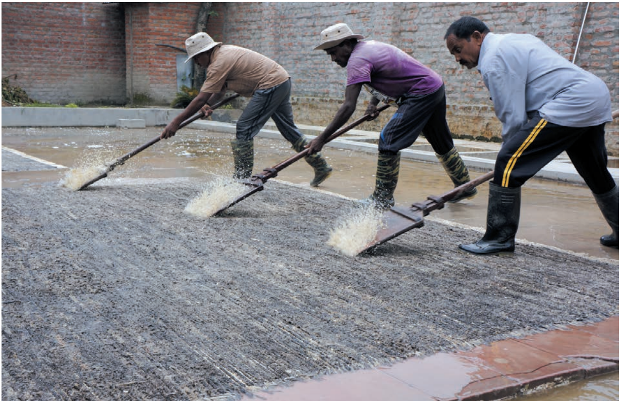
Washed for hours to draw out the luster