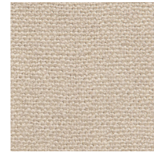
03 NATURAL STATE