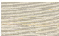
LX1201 Soft Silver