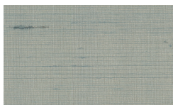
LX1202 Steel Blue