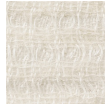
02 FIRST BLUSH