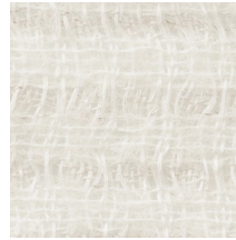
01 WINTER WHITE