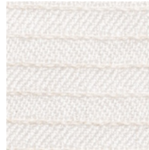
01 SAND PEARL

Our 3 year warranty covers No Worries fabric against loss of color or strength from normal use including exposure to sunlight, mildew and atmospheric chemicals. This warranty only covers the replacement of No Worries fabric and does not cover normal care and cleaning; damage from misuse or abuse; improper installation, or costs associated with replacement of the fabric, including labor and installation.