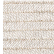
02 SALT ROCK