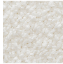
01 WHITE CAP