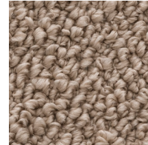
05 HARVEST GRAIN