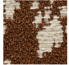
03 OYSTER/ COGNAC