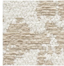
01 WHITE CAP/ OYSTER