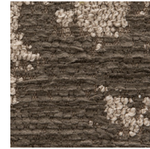
02 HARVEST GRAIN/SABLE