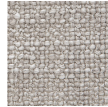
02 WARM STEEL