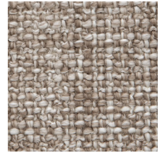
03 NATURAL STATE