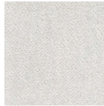
01 WHITE ELEPHANT