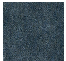
04 BEGINNER'S LUCK