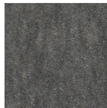
02 LUCKY STRIKE