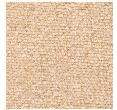
10 GOLDEN WHEAT