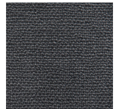
08 NIGHT SKY