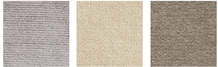
10 CLIFF SIDES