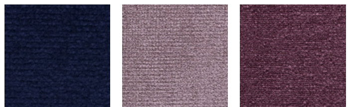
06 BETA BLUE