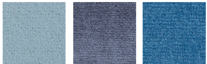
22 BAY BLUE