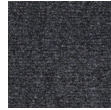
05 MANTA RAY