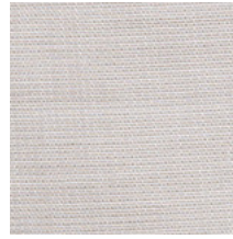
02 PERFECT GREY

CONSTELLATION, a new solid Trevira double-wide sheer, launches in four colors ranging from a cool Platinum to our signature Turq. Featuring a unique sheen and luminosity, this pattern easily schemes with other articles within The COSMOS COLLECTION for a complete story.