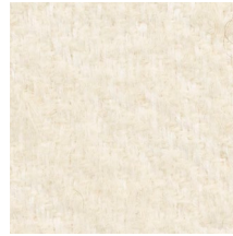
01 SOFT LIGHT